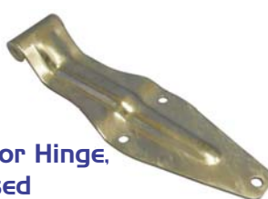
Barn Door Hinge, Galvanised