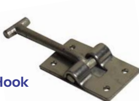
Retainer, Hook 97mm LG