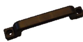
220mm Hole Centres, Nylon Grab Handle