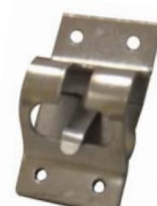
Plate 76mm x 45mm