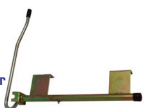
Barn Door Retainer