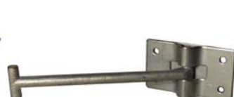
Retainer, Hook 148mm LG