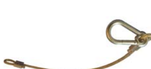
Wire Door Retainer