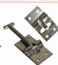
Retainer & Plate Kit