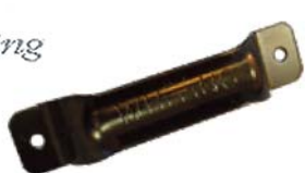
Bolt on Grab Handle