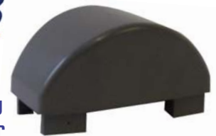
Top Pulley Box Cover Part Number: 2803/001