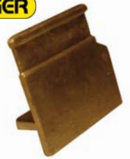
R/H End Cap Part Number: 4175-197-8