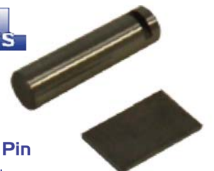
Sprocket Pin Part Number: 20016