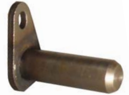
Spindle Part Number: 4151-075-2