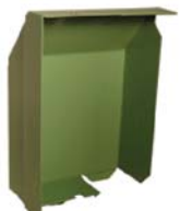
Beam End Cap L/H Part Number: 4172-026-3