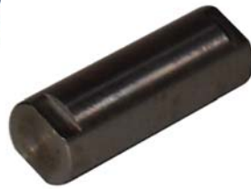
Pulley Spindle Part Number: 2438