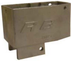
Top Pulley Box Body Part Number: 2802/001