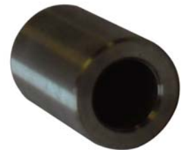
Pulley Axle Tube Part Number: 9638