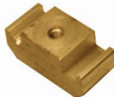
End Cap Retainer Part Number: 3465-033-5