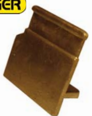
L/H End Cap Part Number: 4175-196-9