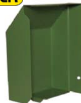
Beam End Cap R/H Part Number: 4172-027-9