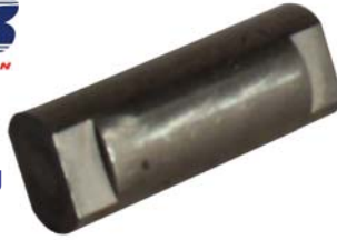
Top Pulley Spindle Part Number: 2843