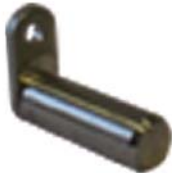
Pulley Spindle Pin 62mm Long Part Number: 4151-107-4